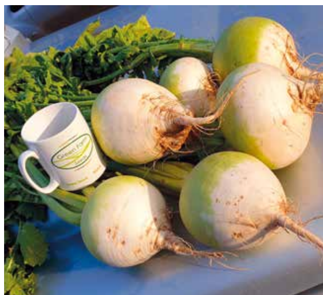
Green Globe Maincrop Turnips, Worcester in November