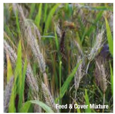
Feed & Cover Mixture