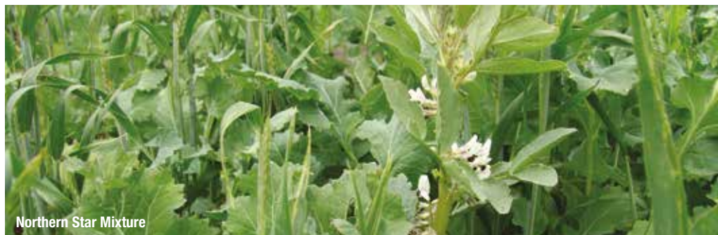
Northern Star Mixture

Sowing rate 62kg/ha Pack size 25kg Treatment Various