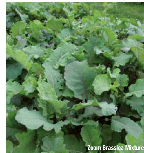
Zoom Brassica Mixture