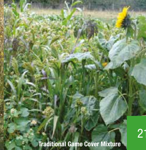
Traditional Game Cover Mixture