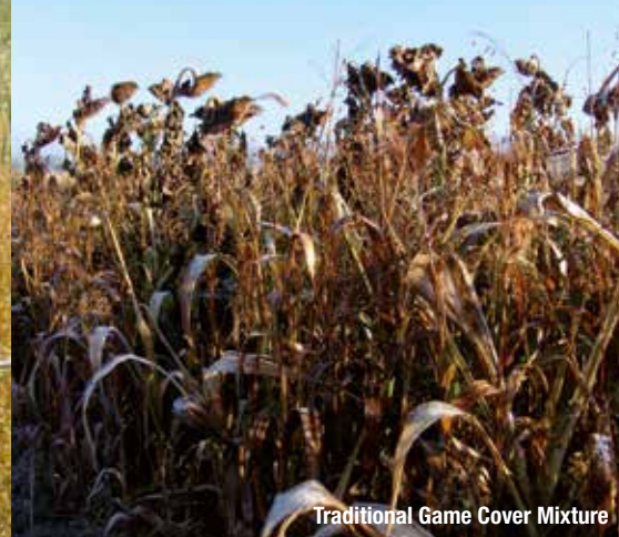
Traditional Game Cover Mixture