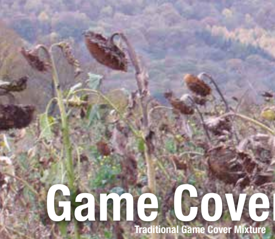
Traditional Game Cover Mixture