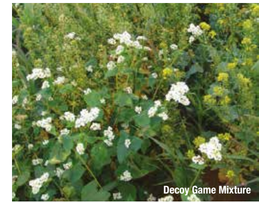
Decoy Game Mixture