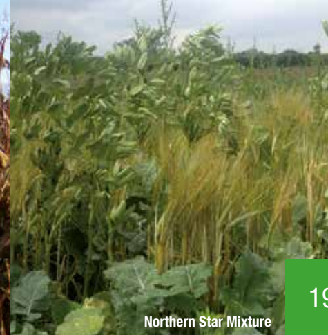
Northern Star Mixture